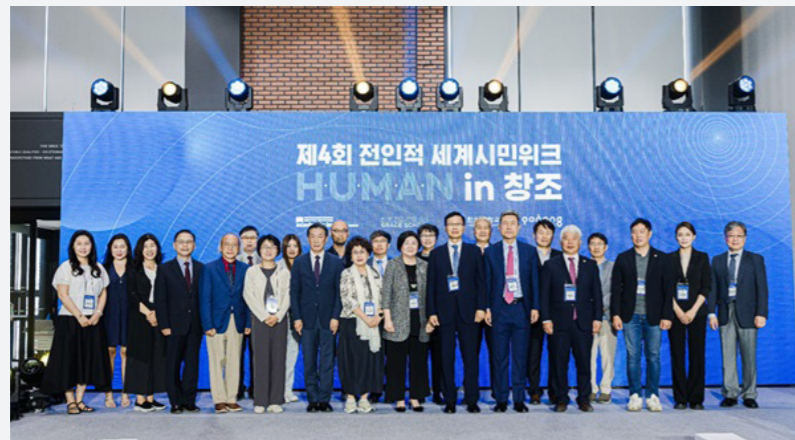
▲ The 4th Holistic Global Citizenship Week

UNAI Korea (United Nations Academic Impact Korea) held the 4th Holistic Global Citizenship Week from the 3rd to the 4th at the Kim Young-Gil GRACE School of Handong Global University under the theme, “Uncertain Future, So We are Global Citizens.”